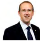
Llyr Gruffydd Plaid Cymru North Wales