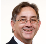
Mick Antoniw (Chair) Welsh Labour Pontypridd