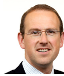
Llyr Huws Gruffydd Plaid Cymru North Wales