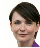
Kirsty Williams Welsh Liberal Democrats Brecon and Radnorshire